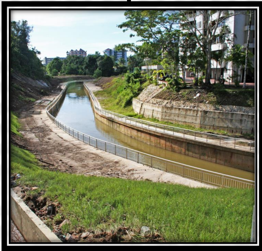
Improve Ecosystem Functions