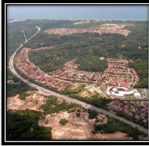
Control the Expansion of the Developed Urban Area