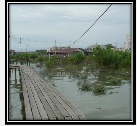
Protect and Enhance Water Quality